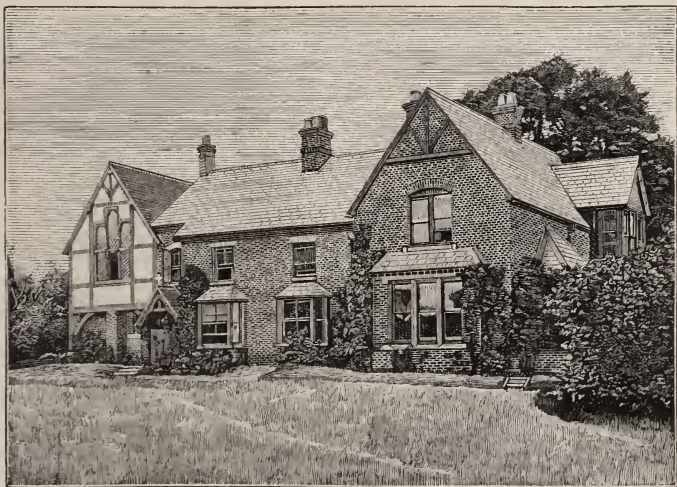
THE HERMITAGE, ASCOT PRIORY.

The source 'of all the unbelief, misbelief, and half-belief around us is that the minds have not brought to themselves this conception. All [difficulties] disappear when one believes God and Jesus, and minds believe in Jesus as they know Him.